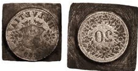
The 20-Cent coins falsified by Farinet

Farinet also gave his name to the smallest and most famous registered vineyard in the world (1.68 m2). Every year, celebrities from the world of sport and the arts come to work on these vines, ensuring that the legend of this Robin of the Alps will live on for many years to come.