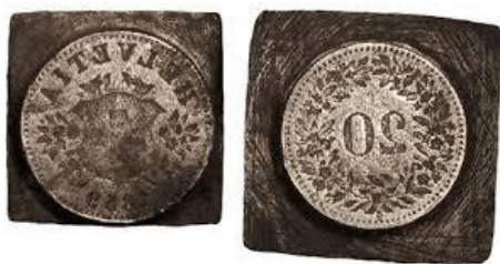
The 20-Cent coins falsified by Farinet

Farinet also gave his name to the smallest and one of the most famous vineyards in the world (1.68 m 2 ). Every year, celebrities from the world of sports and the arts come to work on these vines, ensuring the legend of the Robin of the Alps continues for many years to come.