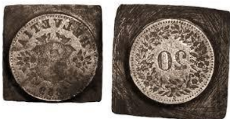
Les pièces de 20 centimes falsifiées par Farinet.

Farinet also gave his name to the smallest and most famous registered vineyard in the world (1.68 m 2 ). Every year, celebrities from the world of sport and the arts come to work on these vines, ensuring that the legend of this Robin Hood of the Alps is perpetuated for many years to come