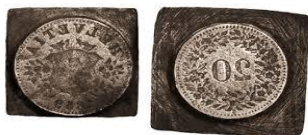
The 20-cent coins counterfeited by Farinet.

Farinet also gave his name to the smallest and most famous registered vineyard in the world (1.68 m 2 ). Every year, celebrities from the world of sport and the arts come to work on these vines, ensuring that the legend of this Robin Hood of the Alps is perpetuated for